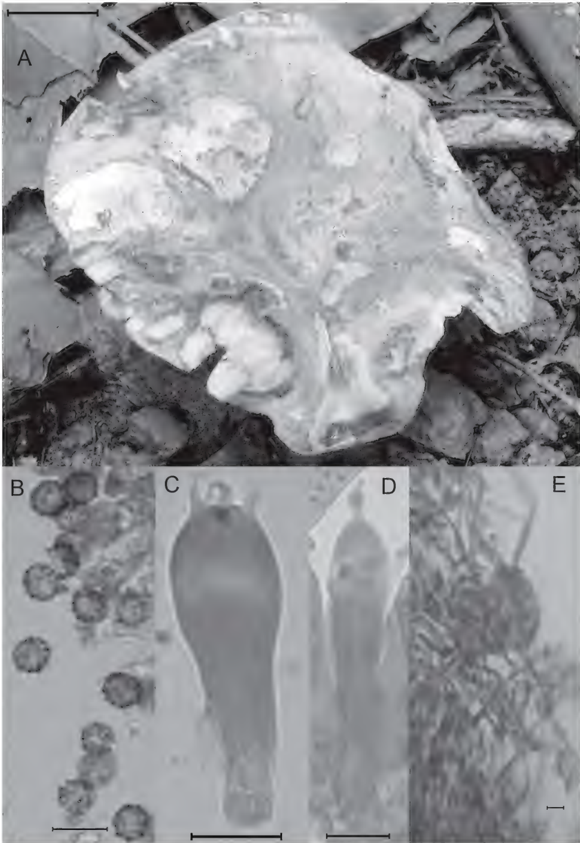
FIGURE 2: Russula purpureonigra . A, basidioma; B, basidiospores; C, basidium; D, macrocystidium; E, pileipellis. Scale bars, 10 mm for basidioma; 10 \mu m for microstructures.